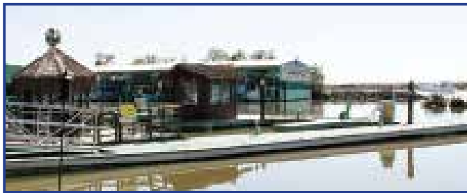
Korth's Pirates Lair, garden spot of the Delta.

Korth's Pirates Lair calls itself "the garden spot of the Delta" and has been family owned since 1937. Their facility includes a restaurant open for café dining (breakfast and lunch), a gift shop and picnic area plus a boat launch and fuel dock (gas only).