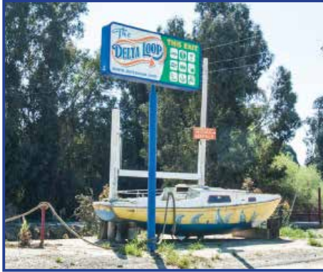
"Loop" sign on Highway 12.

The Delta Loop is a winding levee road along the Mokelumne and San Joaquin Rivers between the towns of Rio Vista and Lodi. When you drive this 10-mile stretch of Brannon Island Road you'll enjoy scenic views of the waterways and farmland on Andrus Island. Along the way you'll also find almost every kind of fun the Delta can provide including fishing, hiking, kayaking/canoeing, boating/