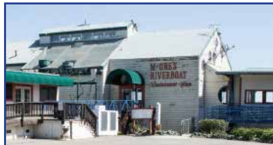
Great dining at Moore's Riverboat.

Sacramento Delta Bay Marina has a mini-mart that sells snacks and drinks plus bait and tackle. Facilities include a guest dock (for day trippers or