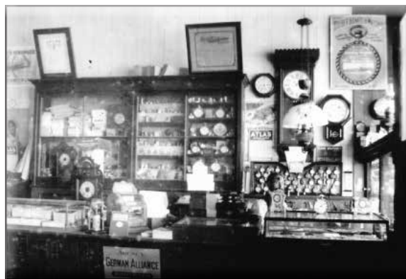
Interior of Bailey's Jewelry Store.