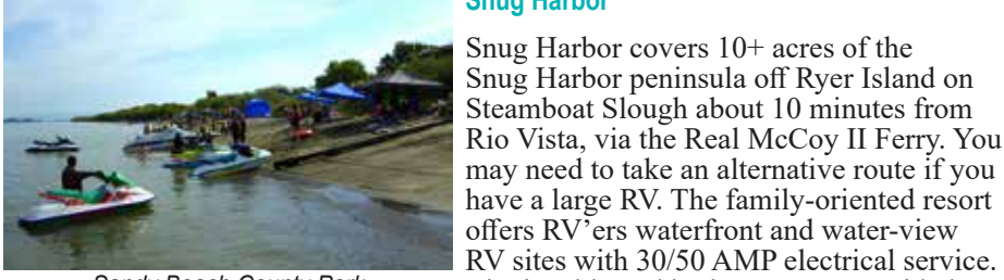
Sandy Beach County Park