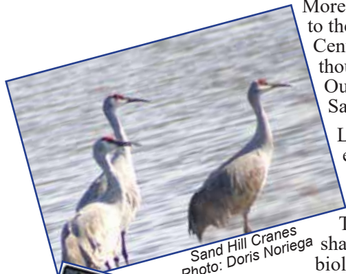
Sand Hill Cranes

More than one billion birds fly south each winter along the Pacific Flyway, according to the National Audubon Society, and about 4 million waterfowl make California's Central Valley their winter headquarters. The pattern of migration has continued for thousands of years, driven primarily by the availability of food and nesting resources. Our unique region offers flooded farm fields, wetlands and other marshy habitat of the Sacramento-San Joaquin Delta, providing an ideal place for birds to spend the winter.