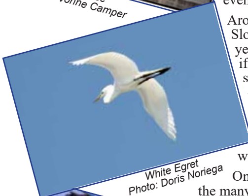
White Egret

Cosumnes River Preserve, alone, is an ideal location for fall/winter birdwatching as it is home to over 250 species of birds. There are eleven miles of trails, a mile-long wetland boardwalk and a self-guided auto tour plus many other special event options.