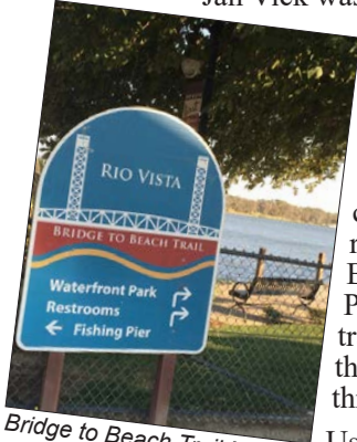
Bridge to Beach Trail Marker