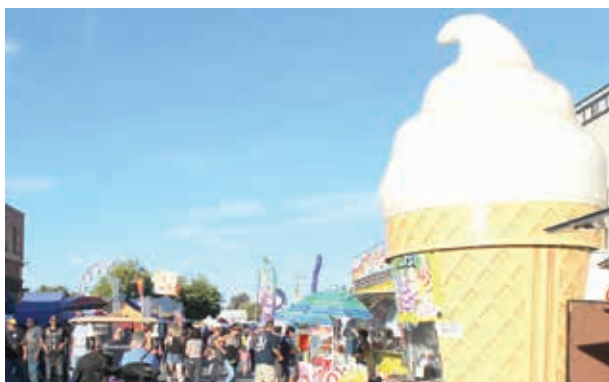
The vendor area.

Join us at the 70th Annual Bass Derby and Festival, a living expression of Rio Vista's past, present and future. We look forward to celebrating this amazing Rio Vista event with you.