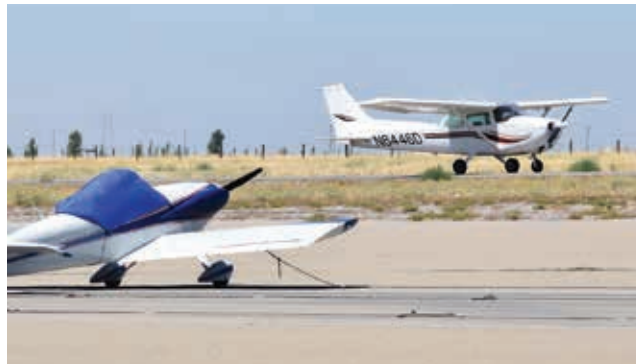
Airplanes at the airport.

The sky's the limit. Where else can you tour the great expanse of Delta waterways in less than an hour by air? Come to our airport and realize a whole new aspect of Rio Vista!