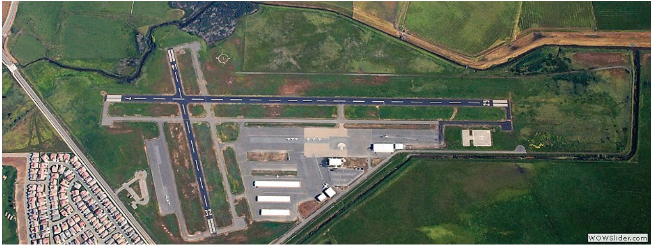
Aerial shot of Rio Vista Municipal Airport.

Not many towns are accessible by land, river or air. Rio Vista has something special that many towns our size do not – an airport. It was