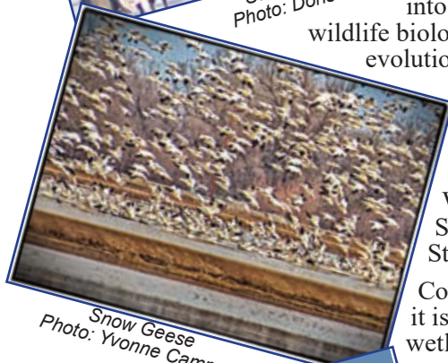
Snow Geese