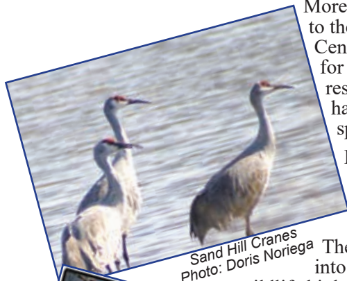
Sand Hill Cranes

People visit the Delta from all over California to see the Sandhill Cranes and the rich variety of migratory fowl. Serious birders even travel from other countries to experience our beautiful gallery of Pacific Flyway Birds. During a solitary walk, a casual amble, or a planned family outing, the birds you may see will inspire your imagination and love of the environment.