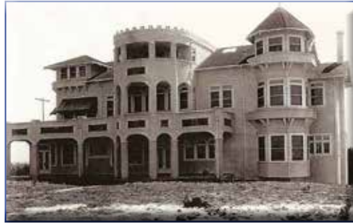
"The Castle" on Grand Island.