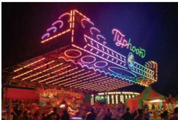
The always popular carnival.

noon down the middle portion of Main Street. The Travis Air Force Band, "Mobility," performs live at 11:30 a.m. followed by Open Mic in the afternoon. The Fishing Derby Awards and Ceremony commence at 4:00 p.m.