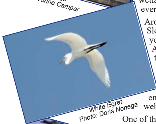
White Egret