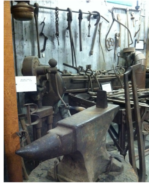
Some of the blacksmith's tools and equipment