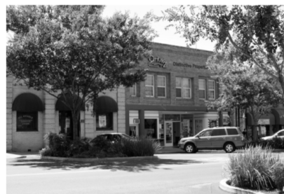
What the Old Rio Vista Theater is Today