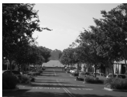
Upper Main Street Today