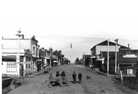
Upper Main Street