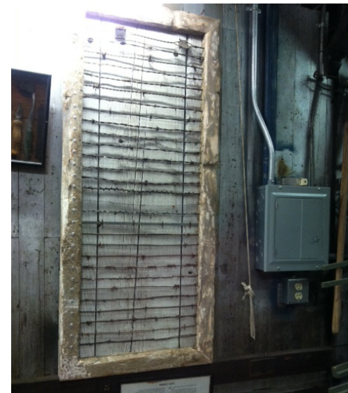
This display shows 29 different kinds of barbed wire in use by local ranchers through history