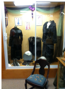
Some of the elegant turn of the century dresses on display

freighter rammed the bridge in the fog and took out a section that took 22 days to repair, meanwhile shutting down the only highway crossing the Sacramento River below the City of Sacramento. Another exhibit documents the thriving asparagus packing operation that was a major industry in the town, and yet another features all of the appliances and equipment that would be found in a turn of the century kitchen and household.