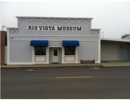
This unassuming building on Front Street, at one time a blacksmith shop, houses the largest historical museum in the California Delta

156 years of Rio Vista's colorful history awaits your discovery in the Rio Vista Museum. Founded in 1975, the Museum has collections of items including 19th century clothing, handcrafts, tools and household implements of all kinds, military uniforms, firefighting implements,