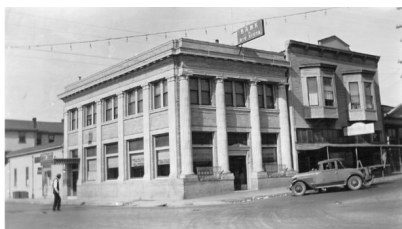
Bank of Rio Vista in 1929