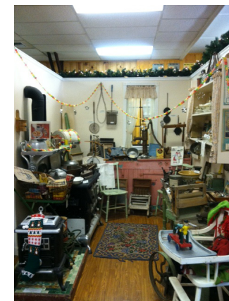
The hand-cranked washing machine is among the many household implements