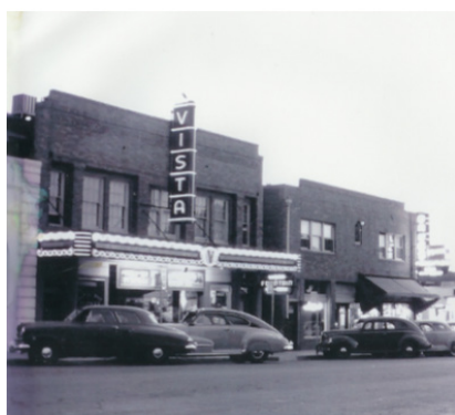
Rio Vista Theater