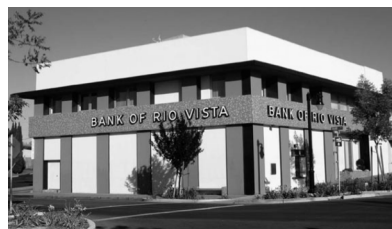
Bank of Rio Vista Today