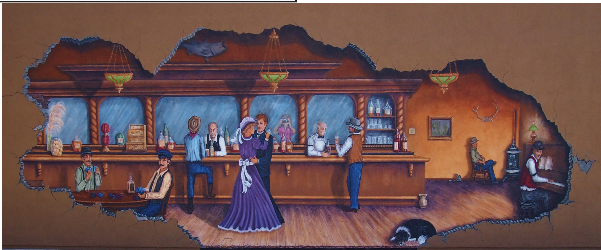
Empire Saloon Mural at 2nd and Main Streets in Rio Vista

LARGE SELECTION OF LIQUOR & WINE FULL DELI DEPARTMENT FULL SERVICE MEAT COUNTER FRESH PRODUCE & FLOWERS