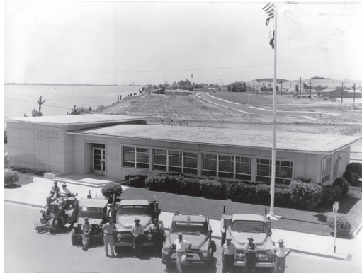
City Hall Years Ago, and Today