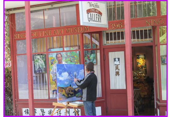
Ning Hou Fine Art Gallery in Locke.

The final stop is the little known Our Lady of Chau Son Monastery, run by Cistercian monks from Vietnam, where you can walk through the Stations of the Cross at sunset and marvel at one last gem in the Delta, a place of community, history and nature.