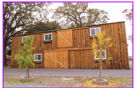
The barn at Steamboat Landing.

Near Hood Barbara stops at the River Road Vintners & Brewery Exchange/Antique shop, formerly a cold storage produce facility, and discusses its planned