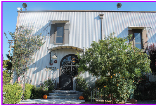
Historic Imperial Theatre/Iron Works in Walnut Grove.