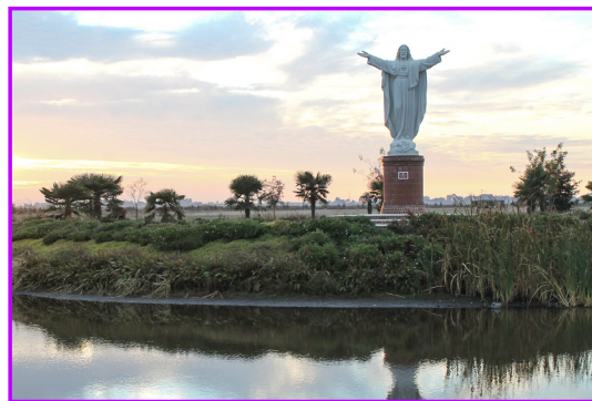
Our Lady of Chau Son Monastery.