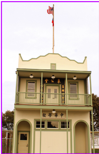
Bing Kong Tong Society Building in Isleton.

First stop is the Dutra Museum in Rio Vista, where Barbara launches into the significance of clamshell dredging to the evolution of the Delta. She's quick to point out several other points of interest and to extol the wonderful restaurants in town such as Foster's and The Point.