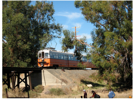
Ride a historic electric train on the five mile track to the Pumpkin Patch Festival in scenic Gum Grove Station, a wooded glen far from the trappings of modern life.

The Western Railway Museum is located on Highway 12 between Rio Vista and Suisun. The museum is built along the former mainline of the Sacramento Northern Railway. The collection focuses on trolleys, as it is primarily a museum of interurban transit equipment. The Museum has the largest collection of Sacramento Northern Railway equipment in existence and operates a line of the former Sacramento Northern as a heritage railway with scheduled excursions for visitors.