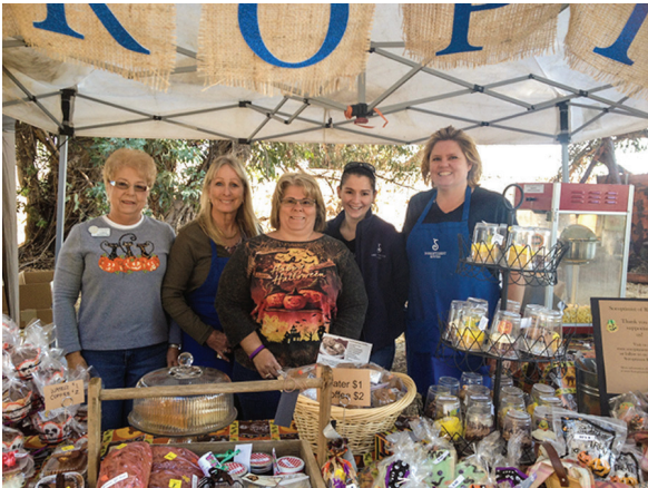
Stop by the Soroptimist booth for amazing baked goods!

Plan your visit to the Pumpkin Patch Festival for the 2nd, 3rd or 4th weekends of October. The museum opens at 9:30 a.m. The first train departs at 10:00 a.m. departing every 30 minutes until 4:00 p.m. Once there enjoy games, live music, hayrides and a petting zoo. Take home a pumpkin or two, test your strength with the pumpkin launcher or explore the huge hay bale fortress. Enjoy the smell of grilled hot dogs and hamburgers sold by the Rotary Clubs of Dixon, Cordelia-Fairfield and Suisun. You don't want to miss the Soroptimist of Rio Vista vast assortment of baked goods the 17th, 18th, 25th and 26th. These delicious treats should not be missed whether you eat as you wander the grounds or take home to have later.