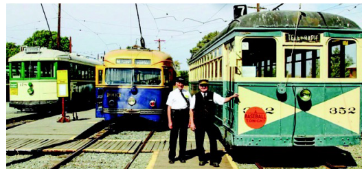
Visitors say the conductors are awesome!

In the Traction Lab Exhibit you explore transportation in the 21st Century. Hands on exhibits include: car vs train, how do electric trains work, and what can you power? Electric trains use electricity from overhead electric wires to power their motors. They can easily use renewable energy sources such as wind and solar rather than relying on fossil fuel or wood.