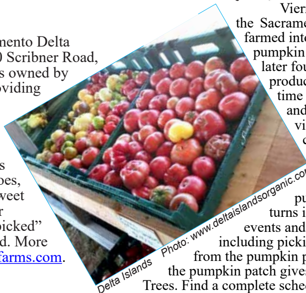
Delta Islands