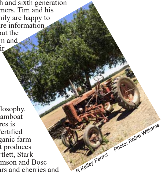
R Kelley Farms

Check out their website at www.steamboatacres.com .