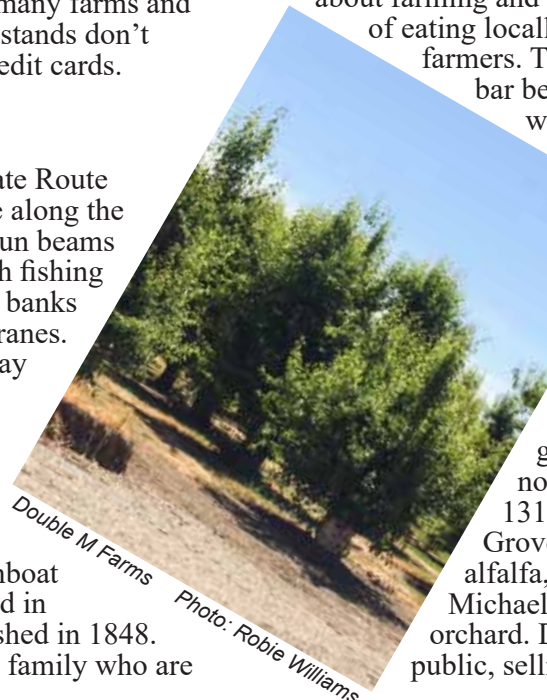
Double M Farms

The next founding member is Double M Farms and McDowell Hunting Preserve. Charlie McDowell, Sr. established the farm in 1947. The third generation of the McDowell Family now operates the farm located at 13161 Grand Island Road in Walnut Grove. Current crops include pears, alfalfa, wheat and specialty fruits from Michael McDowell's private collection orchard. Double M opens their farm to the public, selling picked and pick your own pears.