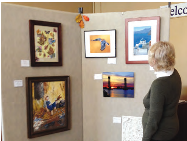
A visitor peruses the gallery.